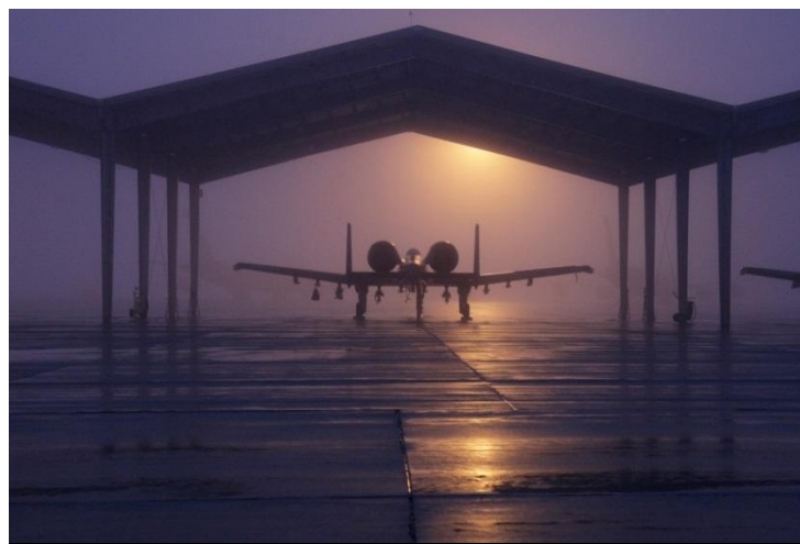
A-10 parked at Selfridge ANGB

It's hard to keep track of who wanted a shirt (some don't) and who received one already so until I hear to the contrary, I'm going to assume that all of our current volunteers have already received their shirt. If my assumption is incorrect, and it probably is, please call me and we'll get it on order.